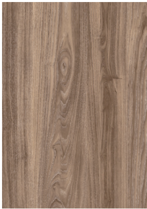
GFT K8019 Oak