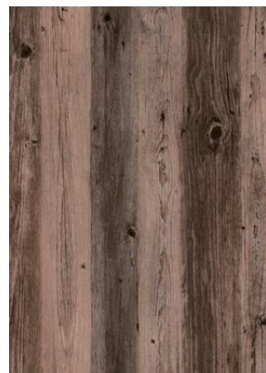
GFT KS8007 Chinese Fir