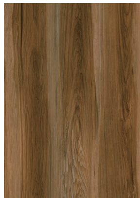
GFT K8011 Hickory