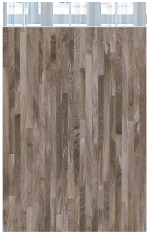
GFT K8023 Oak