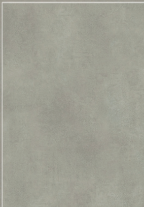
GFT C1002 Cement

We are committed to customer health protection and sustainable development. Proactive in seeking alternatives to phthalates as they have been the subject of scientific debate about their potential impact on human health, we adopt a phthalate free plasticizer technology for our vinyl flooring.