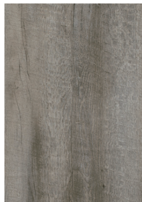
GFT KS8003 Oak