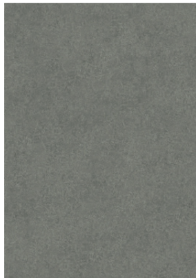
GFT C1001 Cement