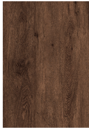
GFT S3003 Oak