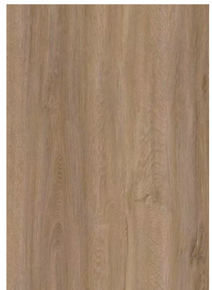
GFT K8017 Oak