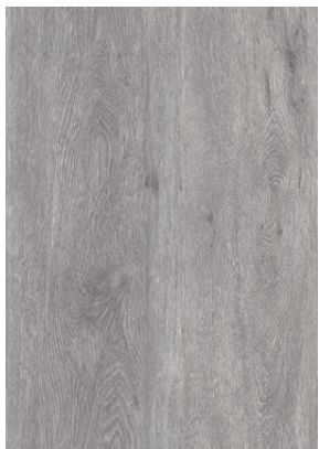
GFT K8001 Oak