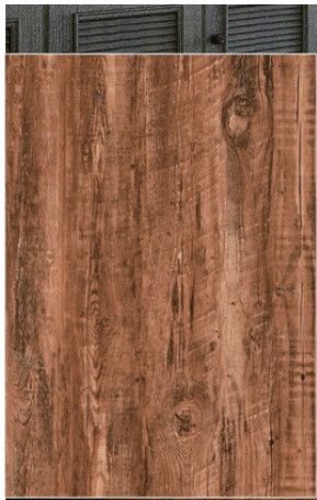
GFT K8007 Chinese Fir