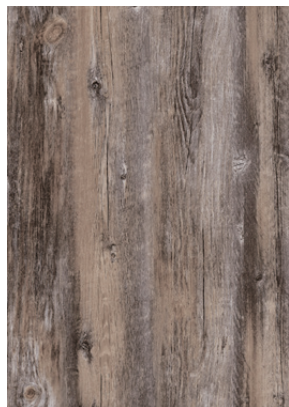
GFT K8009 Chinese Fir