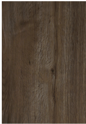
GFT S3005 Rosewood