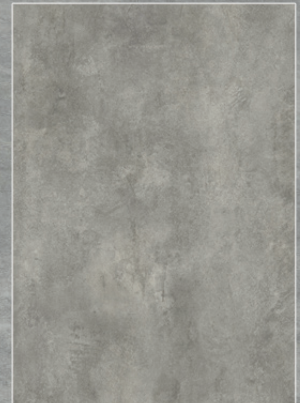
GFT C1003 Cement