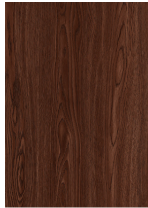
GFT S3002 Oak