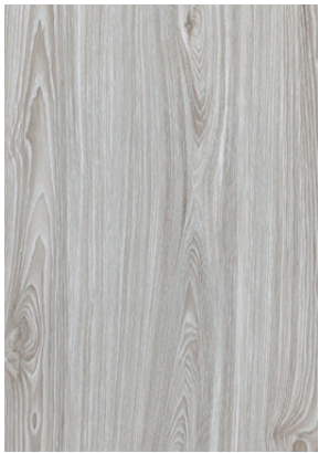
GFT K8028 Oak