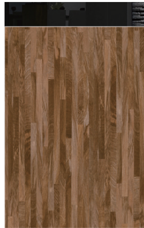
GFT K8022 Oak