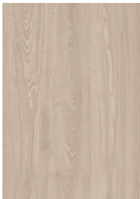
GFT K8005 Oak